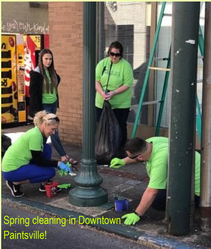
Spring cleaning in Downtown Paintsville!

AMAZING RACE PINEVILLE Saturday, April 20, 2019 10 AM Courthouse